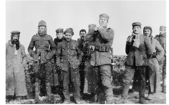
1914 Christmas Truce