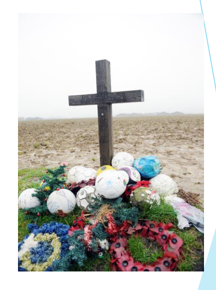
FLANDERS PEACE FIELD

An integral aspect to the GPGs will help contextualise young people's perception of war. It will record their experiences and opinions, which they feel are relevant today - for future generations.