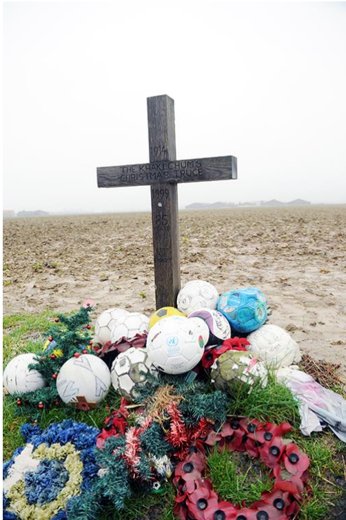
Flanders Peace Field (site of the Christmas Truces)