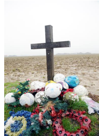
FLANDERS PEACE FIELD

An integral aspect to the GPGs will help contextualise young people's perception of war. It will record their experiences and opinions, which they feel are relevant today - for future generations.