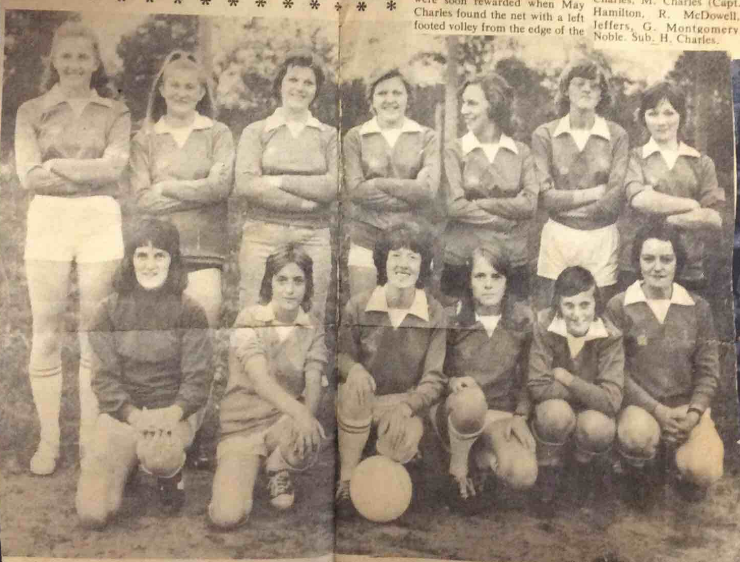
Cookstown ladies football team proudly display their new strin

The Council have selected a trophy which will be presented to each member of the winning team which represented Cookstown in the Derry Civic Week It's A Knockout Competition in June. The mementoes are inscribed players and to have been ordered.