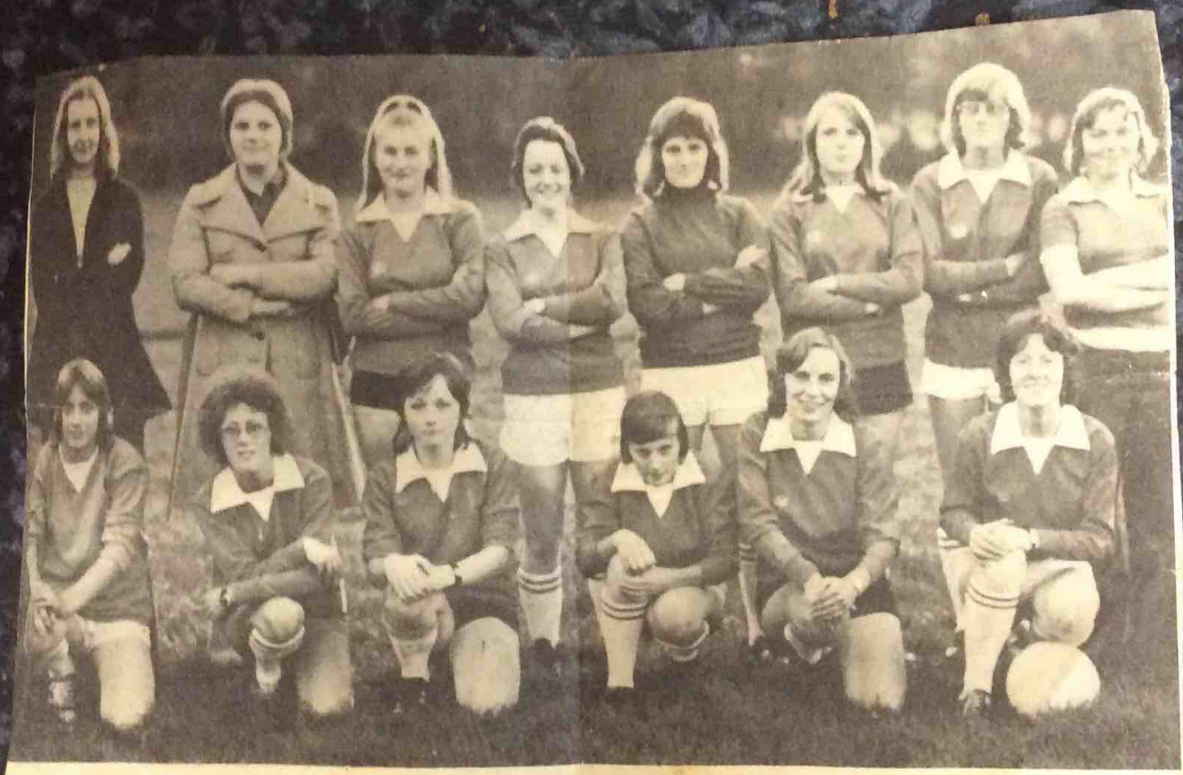
The newly formed Cookstown "Blues" Ladies football team who are competing in the Armagh-Tyrone League.