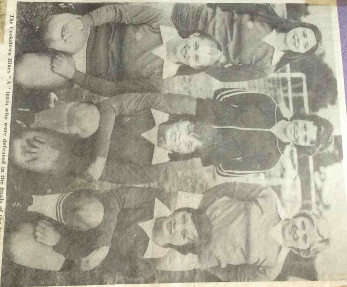
The Cookstown Blues "A" team who were defeated in the finals of the tournament.