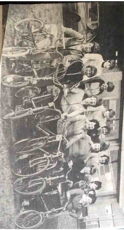
Some of the young men who took part in the C... sponsored by...