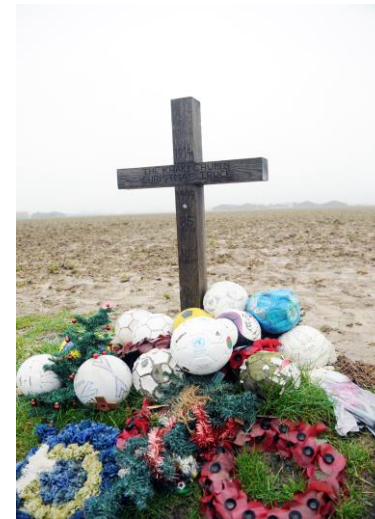
FLANDERS PEACE FIELD

An integral aspect to the GPGs will help contextualise young people's perception of war. It will record their experiences and opinions, which they feel are relevant today - for future generations.