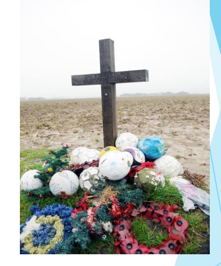
FLANDERS PEACE FIELD

An integral aspect to the GPGs will help contextualise young people's perception of war. It will record their experiences and opinions, which they feel are relevant today - for future generations.