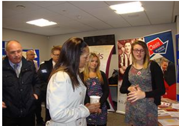
Helen Grant, Minister for Sport, views pupils work at the Football & Peace Project Exhibition

All project teams met the Friday 25 th April deadline and produced their body of work at the Football & Peace Day Celebration exhibition at Maidstone United Football Club's Gallagher Stadium. Furthermore, Kent Rugby Union displayed a series of Rugby programmes from the period of the First World War and Kent County Cricket displayed England and Kent Cricketer, Colin Blythe's cricket bat from the First World War.