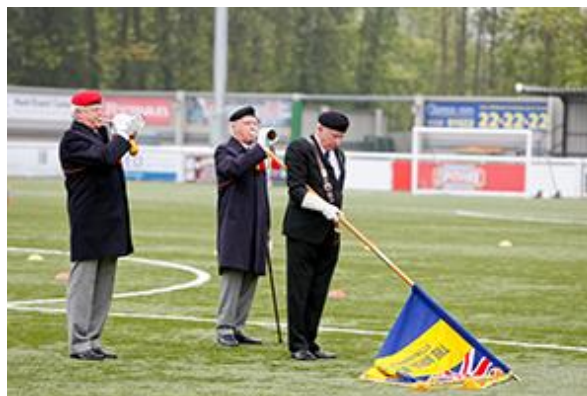
Last Post performed by British Legion

Attended by over 500 people the day started with a commemoration to WW1 given by the Royal British Legion.