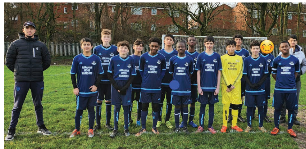
Representing the Denis Law Legacy Trust is Abraham Moss Warriors from Cheetham Hill, North Manchester.