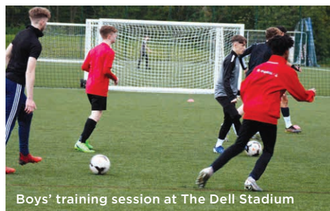
Boys' training session at The Dell Stadium