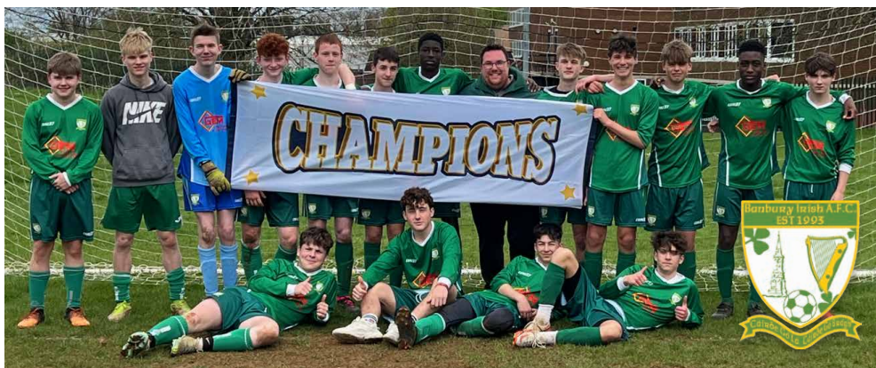
Representing the Cregagh Green Field In Trust is Banbury Irish AFC.

The ethos of the club is “This is your club and not ours so we are all in this together.”