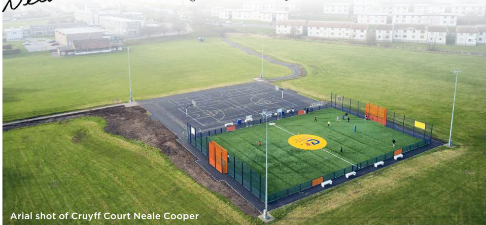
Arial shot of Cruyff Court Neale Cooper

Cruyff Court Denis Law was the first of its kind in Scotland and in 2021 twinned with Peace Field, Flanders in a ceremony which included Denis Law, the charity's patron and Scottish football icon, alongside ambassadors from each of the charity's involved.