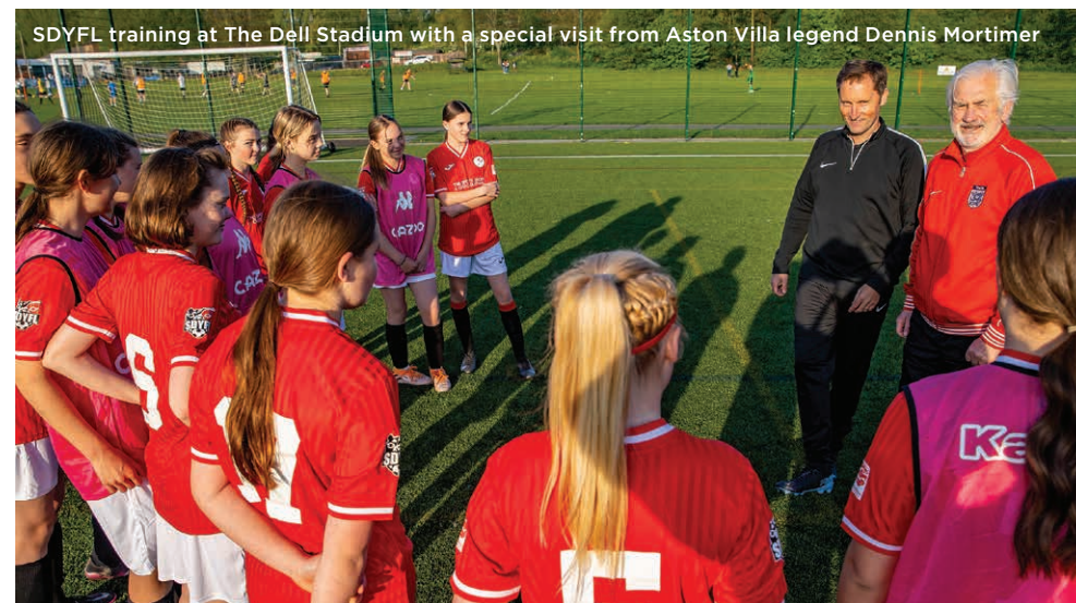
SDYFL training at The Dell Stadium with a special visit from Aston Villa legend Dennis Mortimer