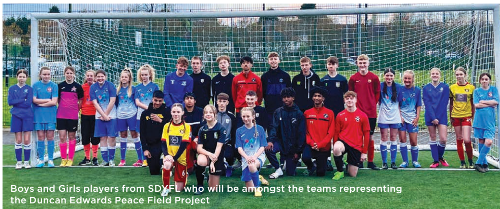
Boys and Girls players from SDYFL who will be amongst the teams representing the Duncan Edwards Peace Field Project

The players representing the Duncan Edwards Peace Field Tournament this year will be selected by coaches in the Stourbridge & District Youth Football League.