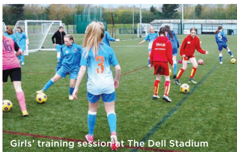
Girls' training session at The Dell Stadium